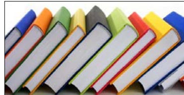
Friends of the Library Book Sale